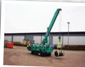
Pick and Carry