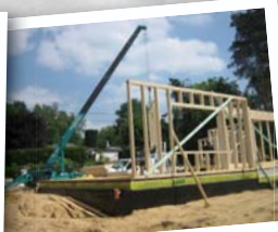
Timber Frame Work